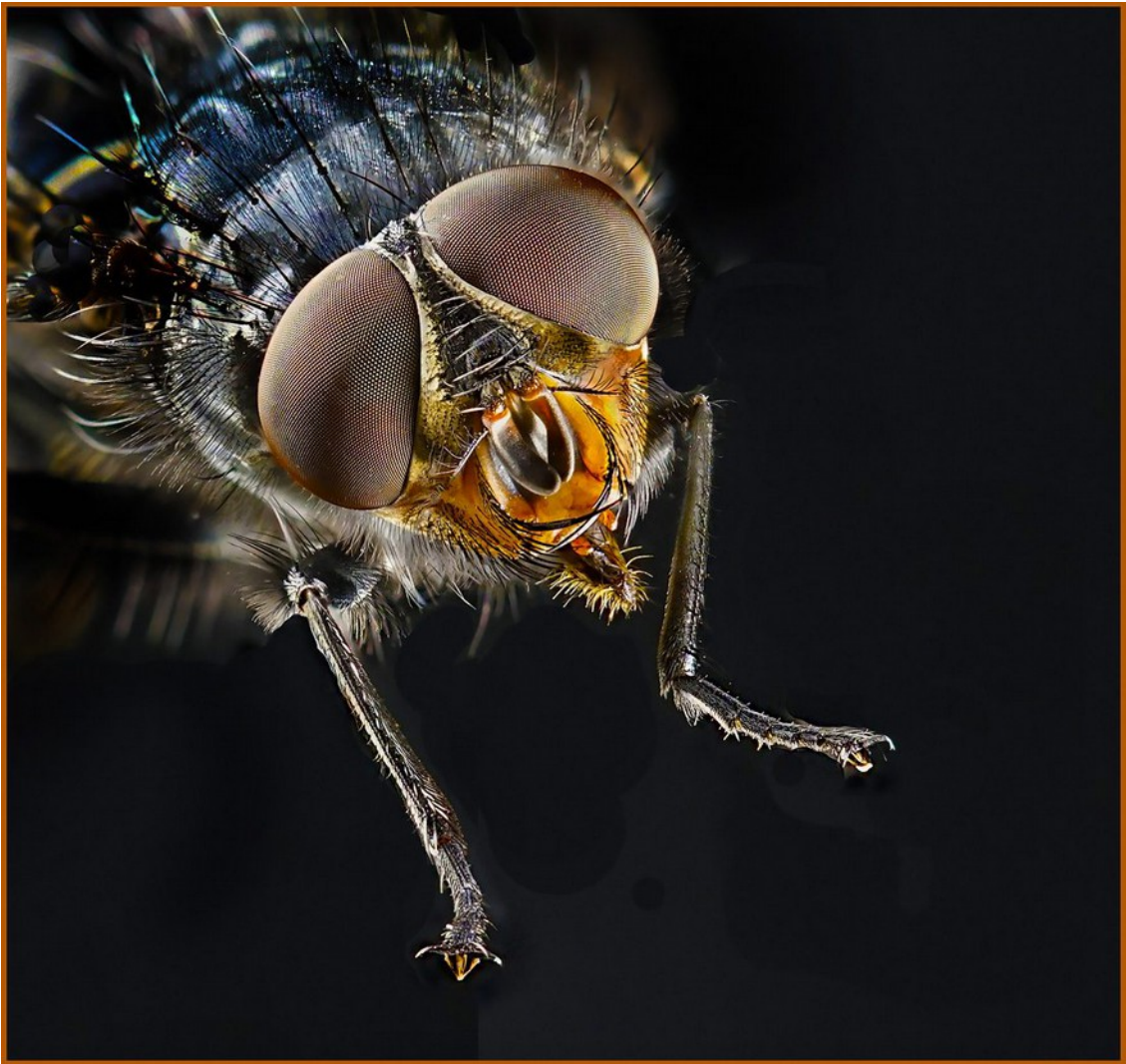
Neal Thompson - "House Fly" - Honorable Mention, Traditional (above)